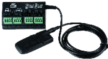
Flex WiFi with Flex Link Relay & Sensor Cable