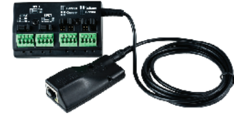
Flex IP with Flex Link Relay & Sensor Cable